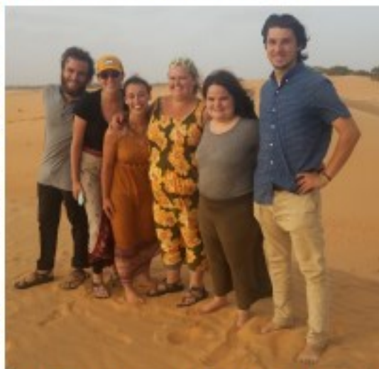
The 2018-2019 Senegal YAGM during our final retreat in July.

If you would like to see more pictures and stories of daily life from YAGM Senegal, please check out our blog at http://yagmsenegal.wixsite.com/blog . On est ensemble! (We are in this together.)